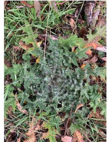
Black thistle →

Like people and animals, plants are very adaptable. Even though our weather is becoming increasingly moody, some plants are rising to the challenge. A fine example of survival of the fittest and strongest.