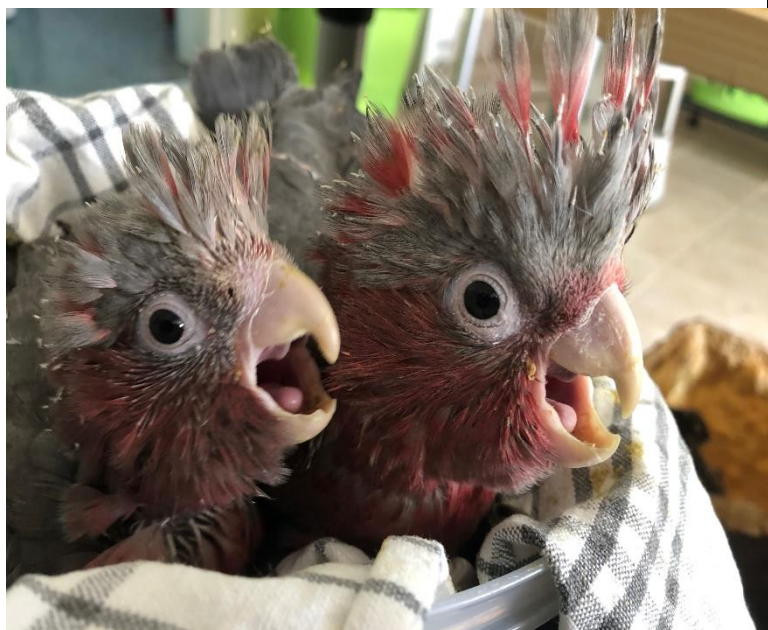
Juvenile galahs rescued from a fallen tree in Jerrabomberra.

It was a big year for bird calls to our 24/7 Helpline, with the number of calls up almost 50% from 1150 the previous year to 1615 calls reported, possibly due to an increase in rainfall following years of drought, and birds searching for habitat following the 2020 bushfires.