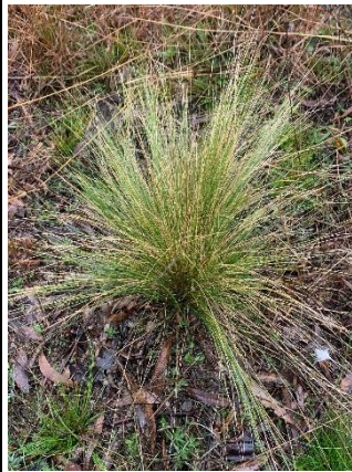
Serrated Tussock ↑

Then we have the regular weeds we all deal with such as Privet , Sticky weed (pictured, left), Serrated Tussock (above right), St Johns Wort , and all the variations of thistles that pop up in our gardens annually. ( Black thistle pictured above right. )