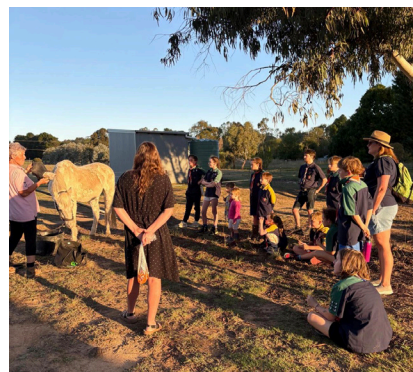
Basking in horse knowledge