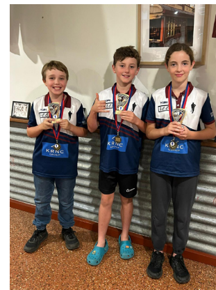
u11 Award Recipients