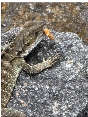
The elusive water dragon named ‘El Capitan’ took more than three weeks to catch for rehabilitation

Our wildlife already struggles to navigate the modern-day environment, urban sprawl, roads and wire fences to name a few - fishing line is one that fishers can easily avoid causing distress and even death for native animals. If your line gets snagged, please do all you can to retrieve as much of the line and tackle as possible from the environment. Someone's life depends on it.