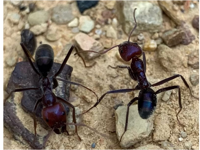
Australian meat ants

So next time you want to do a wheelie over an ants' nest, consider why they are there and what their likely food source is.