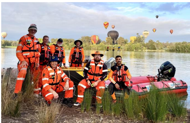
Above: Sutton SES on the water in Canberra with the ACT SES