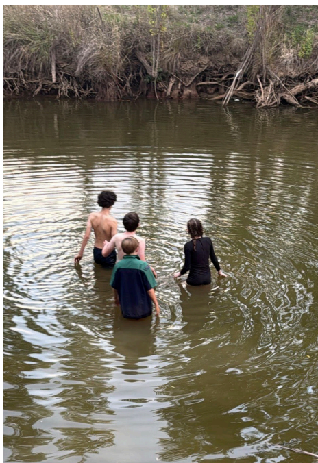
Some of the fisherfolk

And finally, here's what you've been waiting for: with a tent-ative smile!