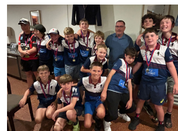
u13 Gundaroo Goats