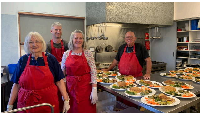
The excellent Gundaroo Hall catering crew

Doors open at 6pm. Performances commence at 7pm.