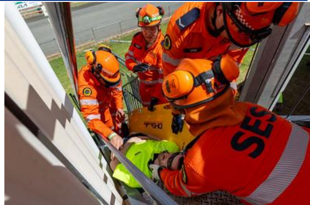
Above: Sutton members working together in a scenario at the Disaster Rescue Challenge in Parkes

Sutton joined ACT SES crews on Lake Burley Griffin for the 2026 Who Let the Boats out Exercise. The annual flood training exercise is designed to strengthen core skills for on-water flood rescue and flood support operations. Participants practice skills such as manoeuvring, launching and docking vessels, search and rescue, recovering persons overboard, radio communications and navigation.