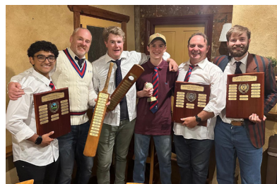
Senior - Award Recipients