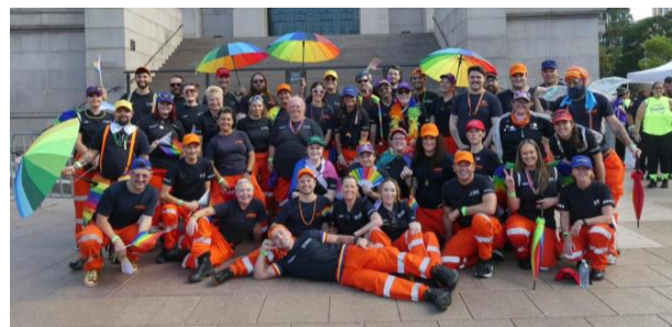
Below: Sutton members join the NSW SES at the Mardi Gras parade in Sydney