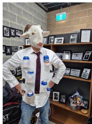
Goat Man - Senior