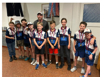
u11 Gundaroo Goats