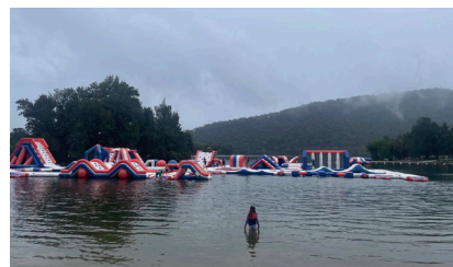
Contemplating the aqua park