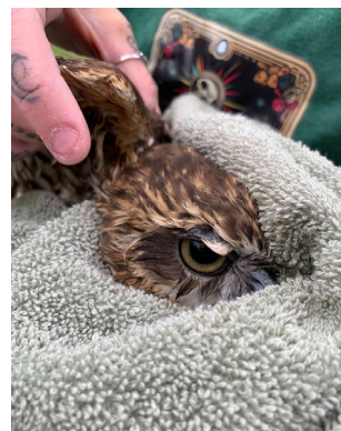
This Boobook owl was spotted 3m up a tree overhanging Lake Jerrabomberra.