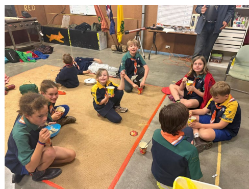
Embracing the noodle