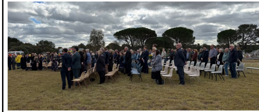
Part of the large crowd at the service at Gundaroo cemetery.

as she was controlling all brigade communications on the day and all contact was lost.