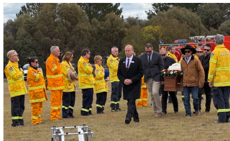
Gundaroo RFS members formed a Guard of Honour at the service.

Despite his passion for the land, it was his lifelong role as a rural bushfire fighter that he was best known.