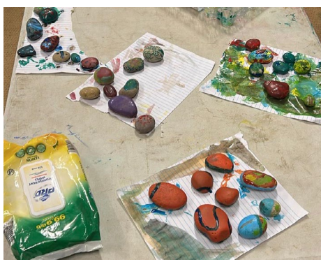
They took a while to dry

Last of all, don’t forget that Scouts love meeting new people – so if you’re mildly extroverted and have some skill or experience you’d like to share with the Scout group, they’d love to hear from you. Tuesday nights from 6 till 7.30 at the Scout Hall at the Oval.